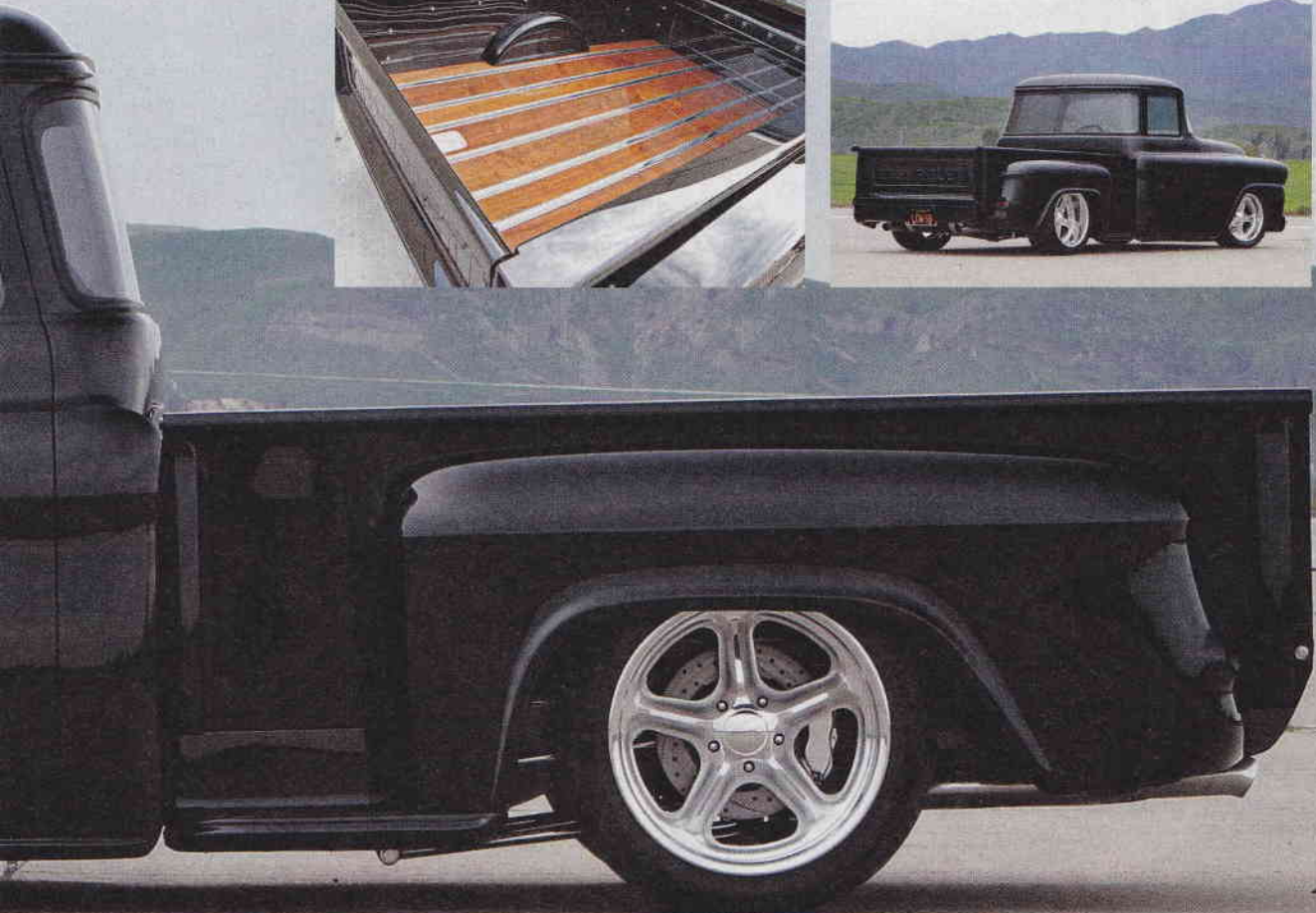
The rear wheelwell openings have been cut, raised, and reshaped to match the front openings.